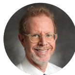
Gilad Kuperman, MD, PhD Relevance Award